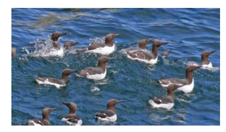
Common Murre at Kenai Fjorde in Alaska