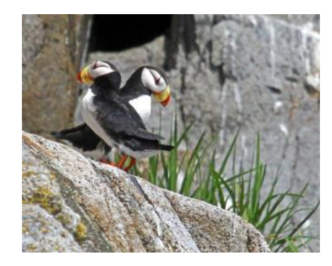
Horned Puffin at Kenai Fjorde in Alaska