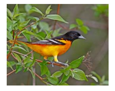
Male Baltimore Oriole in Boone County

In 1981, planning began for Iowa Barn Owl restoration—the first big project of the newly created Iowa Living Resources Program/ Nongame Program/Wildlife Diversity Program. This program will briefly cover the current status of Iowa's seven nesting owl species followed by life history information of the Barn Owl, the different phases of Barn Owl restoration that have occurred during the last few decades, how this program was implemented, and how each person can do her or his part to help this species recover and be removed from Iowa's Endangered Species list. A live Eastern Screech Owl will be used as part of this presentation.