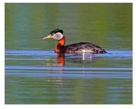
Red-necked Grebe in Alaska