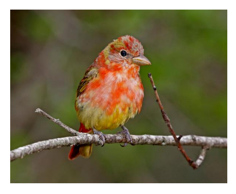
Younger male Summer Tanager in Boone County

NEWSLETTER Volume 54 | Number 4 | April/May/June 2019 http://bigbluestemaudubon.org/