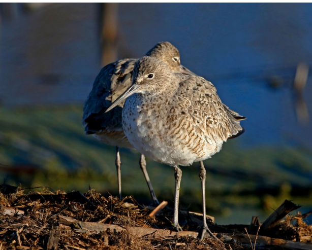
Willet at Bjorkboda Marsh in Hamilton County