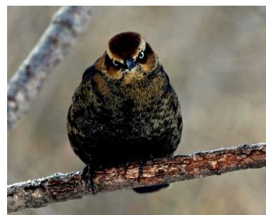
Rusty Blackbird in rural Boone County

Because of the COVID-19 situation, no BBAS field trips are currently scheduled. We plan on resuming our field trip schedule this coming fall 2021. Watch for email notifications and information in future newsletters.