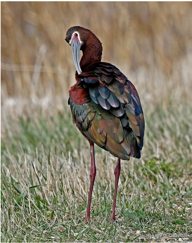
White-faced Ibis at Snake Creek Marsh in Greene County