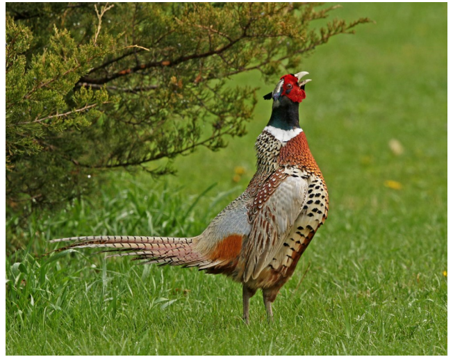
Ring-neck Pheasant crowing in rural Bone County

Buying from the businesses listed on this page not only benefits the birds but also helps our local economy and provides funding for BBAS. Donations fund various habitat restoration and educational projects. Present the coupons at the time of your purchase and a donation will be given to BBAS.