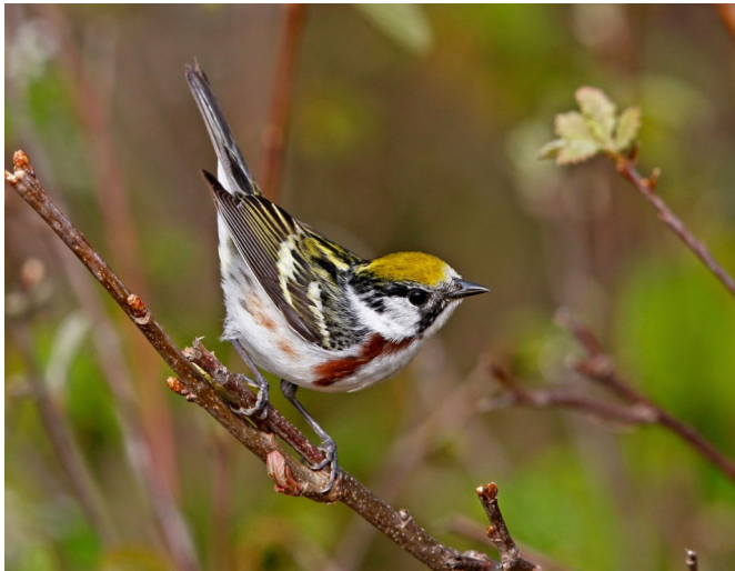
Chestnut-sided Warbler in rural NW Wisconsin

BBAS is tentatively planning to have Bird-A-Thon this coming May 2021. May 8 is the tentative date. We hope this will be possible as more people are vaccinated and with social distancing. Watch for notification emails with more information. Participation in Bird-A-Thon is fun and our largest fundraising event.