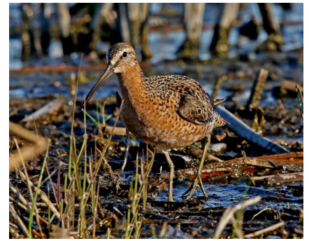
Short-billed Dowitcher in Boone County near Bjorkboda Marsh