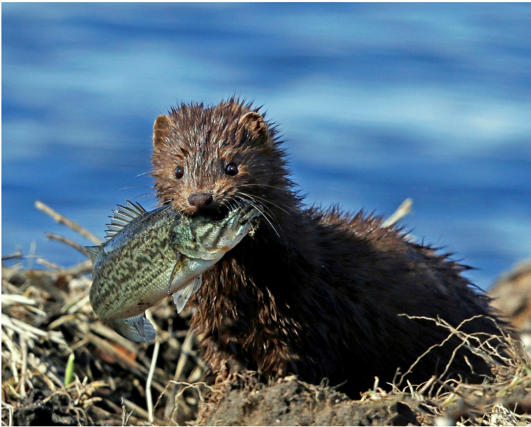
Mink at Swan Lake State Park in Carroll, Iowa.