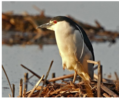
Black-crowned Night Heron at Bjorkboda Marsh in Boone County

These kinds of interactions in nature play out countless times wherever we live. I was just fortunate enough to see it. My hope for all of you is, in the midst of this pandemic - of which we have long since grown very weary - that you will see these remarkable relationships in nature, things that will make you smile in happy wonderment, and that will sustain your spirits during this challenging time.