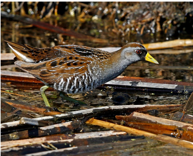
Sora in Hamilton County near Bjorkboda Marsh