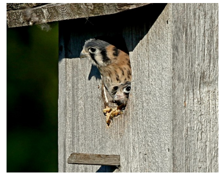
Young Kestrels looking out of their nest box in rural Boone County, June 2021