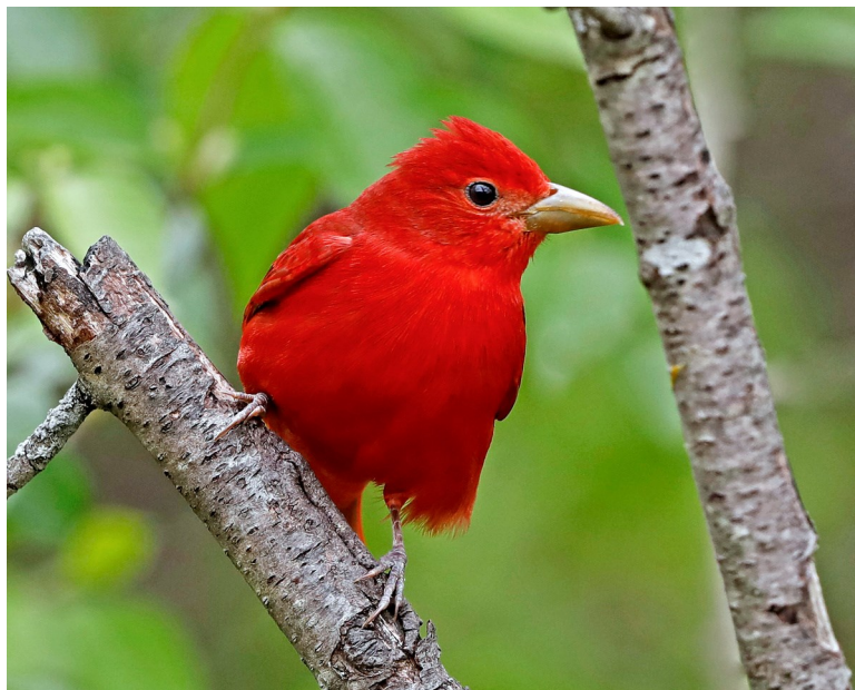
Summer Tanager in Spark's Cemetery area of Boone County in May 2021

After 8 Cy-Hawk Challenges, we are now 2-5-1 against ICBC.