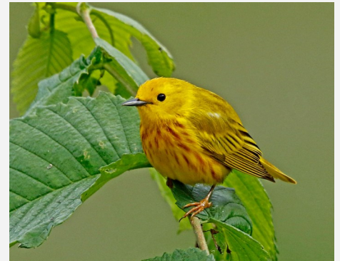
Yellow Warbler near Ledges Park in July 2021