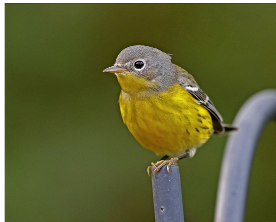
Fall migrant Magnolia Warbler in Spark's Cemetery area of Boone County, September 2021