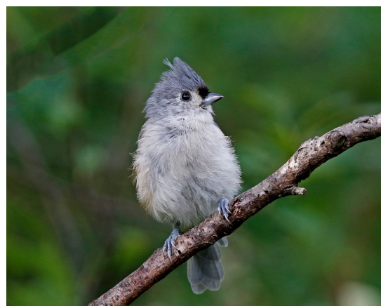
Tufted Titmouse in Rural Boone County, September 2021 | Photo by Larry Dau