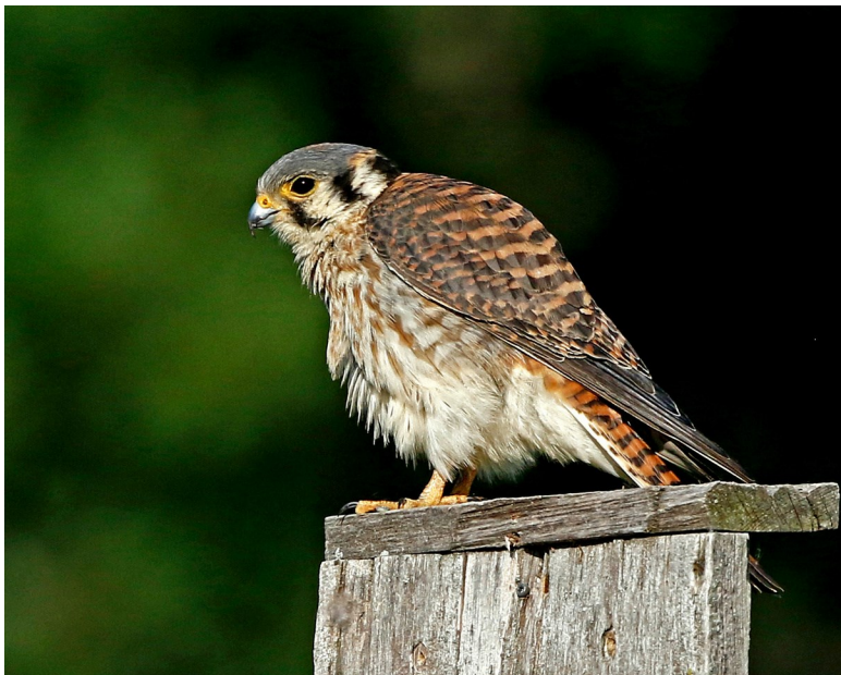
Female Kestrel on her nest box in rural Boone County, June 2021

NEWSLETTER Volume 57 | Number 1 | September/October/November 2021 http://bigbluestemaudubon.org/