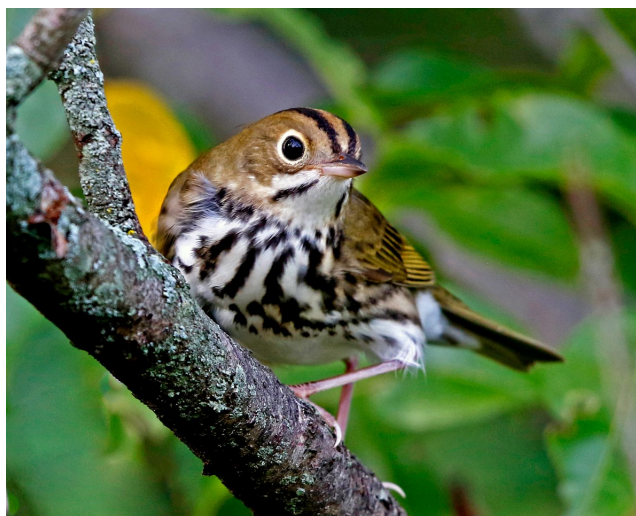
Caption Ovenbird in rural Boone County, September 2021

No field trip in December due to Christmas Bird Counts