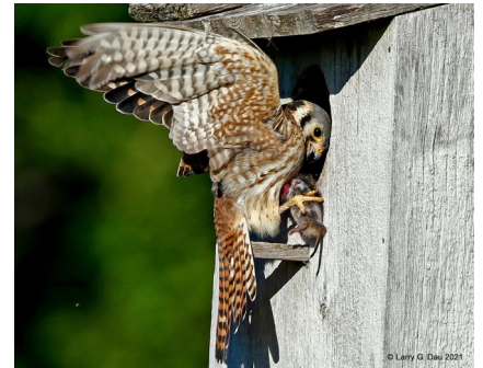
Female Kestrel bringing a vole to her nest box to feed her young in rural Boone County, June 2021