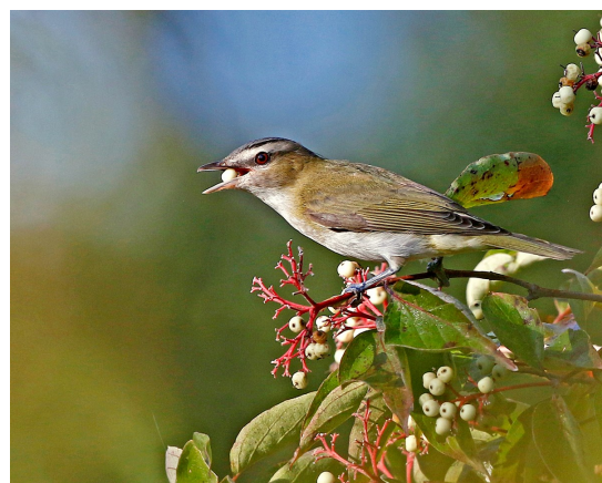
Red-eyed Vireo in Spark's Cemetery area of Boone County, September 2021